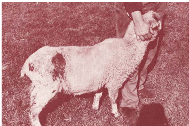
Figure 2: Sheep with strike wounds on hip

Infected sheep will have a moist wool coat, visible maggots and a characteristic odour. Often the wool will have a brownish discolouration. Any sign of wool staining should alert farmers to carefully check their sheep. Sheep with severe strike may be found depressed or even down. These animals often have such severe lesions that they cannot be saved. Careful examination of these animals will show destruction of skin and muscle and even wounds opening into the body cavity.