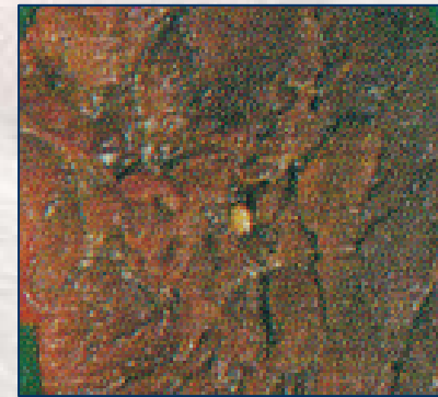
Figure 2: Taenia krabbei cyst in moose steak.