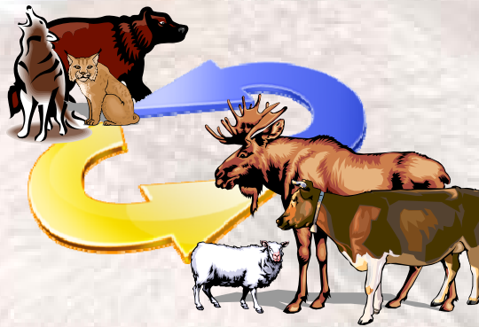
Figure 1: Predator – Prey Life Cycle.

The cyst can be found in the muscles and heart of moose and occasionally in the caribou. It was not very common on the Island of Newfoundland until the early 1980's. First reports appeared on the southwest coast, then progressed to the east.