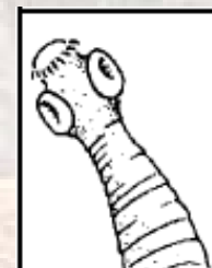
Figure 4: Scolex of the Adult Tapeworm.

Sometimes there are only a few cysts in the muscle that can be easily picked out, while other times there are hundreds visible. They are yellowish and a bit bigger than a grain of rice. There is no direct risk to human health from eating the cooked meat. There is no need to reject or waste a moose carcass because of a few cysts that can be easily removed. It is understandable, though, that if there are large numbers visible, the meat may not look appetizing.