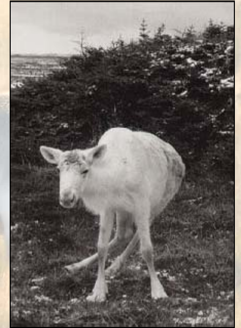
A severely infected caribou.

Caribou infected with this worm show several behaviour changes, including isolating themselves from the herd, staying in one location, losing their fear of humans, seeming disoriented and developing an abnormal posture and gait. Sick animals may even be seen walking in a continuous circle. They may also become thin even though they continue to eat.