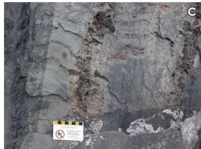
Plate 9. South side of Trans-Canada Highway, immediately east of site of old Glenwood overpass (LD05-0002). This classic locality of Williams (1972) was partially destroyed during highway upgrading in the early 1990s. A. Looking west. B. Looking east. C. Close-up of fine grained, massive micaceous sandstone with weathered-out shelly, calcareous fossiliferous layers.