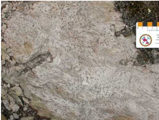
Plate 8. Stictopora scalpellum (Lonsdale, 1839) covering outcrop at “Bryozoan Ridge” (LD05-0360). The species most commonly occurs alone, or with abundant crinoid debris.

Ludlow and latest Llandovery to Prídolí species, respectively. Microsphaeridorhynchus nucula (Sowerby, 1839) occurs in both the Gorstian and Ludfordian stages of the Ludlow Series (Watkins, 1979; Molyneux, 2005). At Arisaig, Dawsonoceras arisaigense McLearn, 1924 occurs in the uppermost McAdam Formation (McLearn, 1924, page 157) of