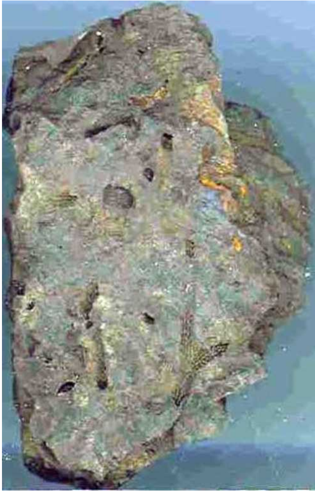
Plate 3. Stictopora scalpellum (Lonsdale, 1839) from “saw-dust pit”.