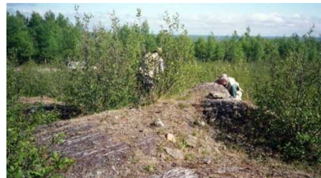
Plate 7. J. Lake (left) and G.C. Squires (right) examine steeply dipping reddish sandstone (LD05-0077) at the fossil locality of Blackwood (1982, pages 42, 43; Plate 17). The site now is badly overgrown, and the best fossiliferous layers appear to have been quarried away for roadfill.