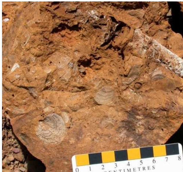
Plate 10. Brachiopod-rich block of brown-weathering, fine-grained micaceous sandstone in gravel pit (LD05-0022). Note the well preserved valve of Atrypa sowerbyi Alexander, 1949? in the lower left corner.