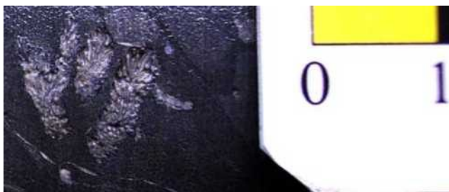
Plate 4. Cross-section of branching Stictopora scalpellum (Lonsdale, 1839) from VVC Exploration Corporation drill-hole 04-143, ~ 42.66 m depth (2004F016). Scale in cm.