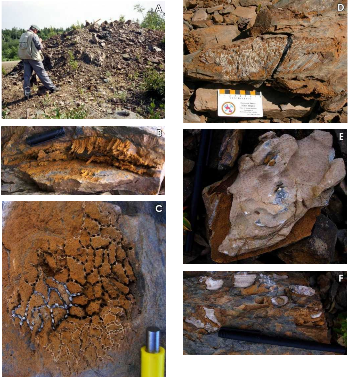
Plate 11. The Derek Fancey Locality (LD05-0397). A. G.C. Squires examining coral-rich outcrop. B. Colonial coral Favosites sp. - side view. Pen top for scale. C. Colonial coral Halysites catenularius (Linnaeus, 1767)? - top view. Pen top for scale. D. Halysites catenularius (Linnaeus, 1767)? - oblique side view. E. Colonial coral Heliolites interstinctus (Linnaeus, 1767)? Pen (left) for scale. F. Specimens of the solitary coral Ketophyllum sp. Pen (bottom) for scale. B, C, E and F courtesy of G.C. Squires.