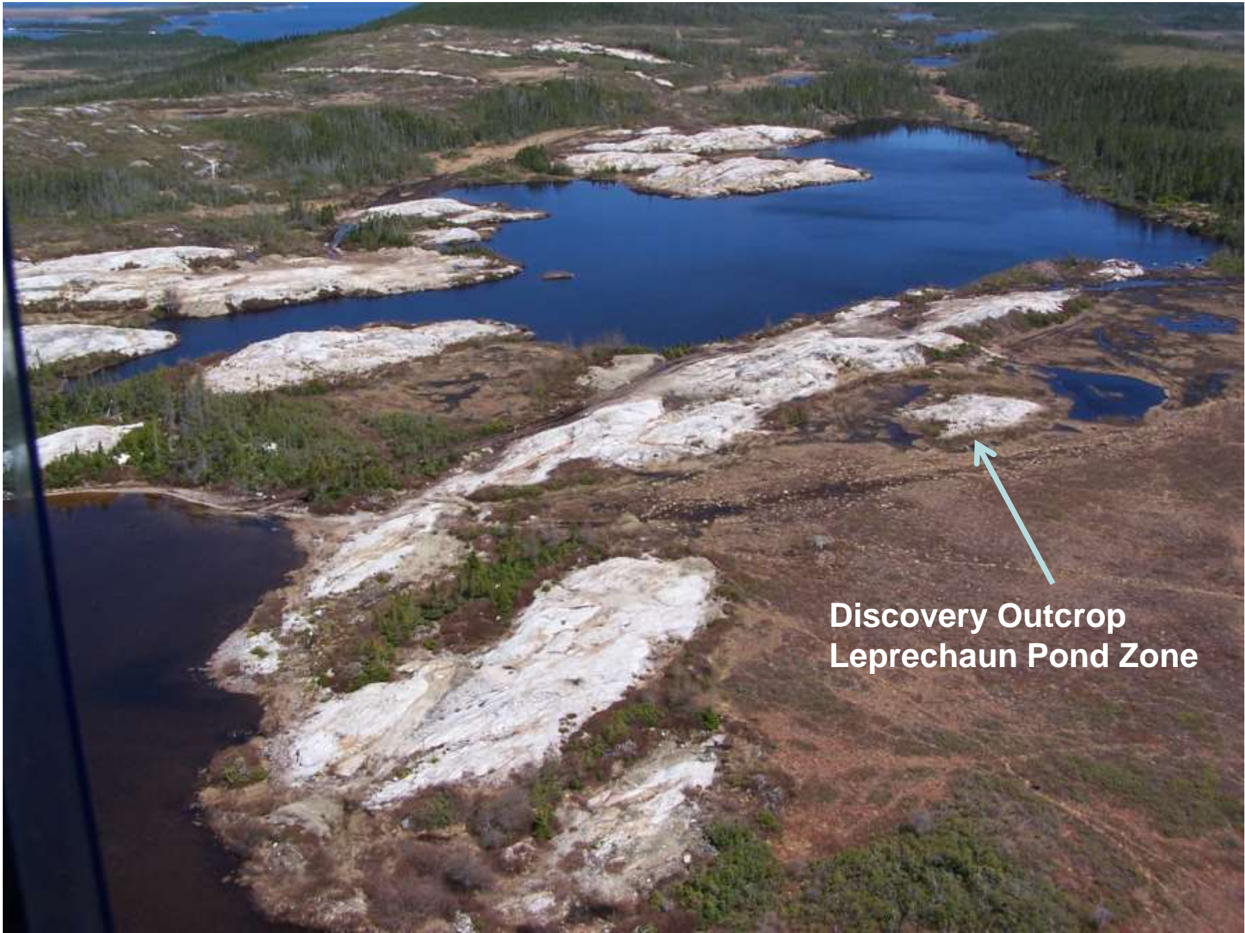
Discovery Outcrop Leprechaun Pond Zone