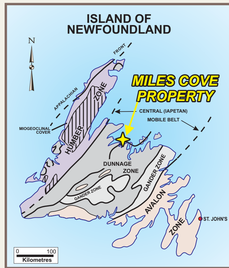
Map 1. Property Location Map

The Miles Cove Property consists of 69 claims located in northern Newfoundland on Sunday Cove Island approximately 0.5 km south west of the small community of Miles Cove. The Miles Cove Road and causeway connects Sunday Cove Island to Route 380, a paved highway which joins the Trans Canada Highway approximately 15 km to the southwest (Maps 1 and 2).